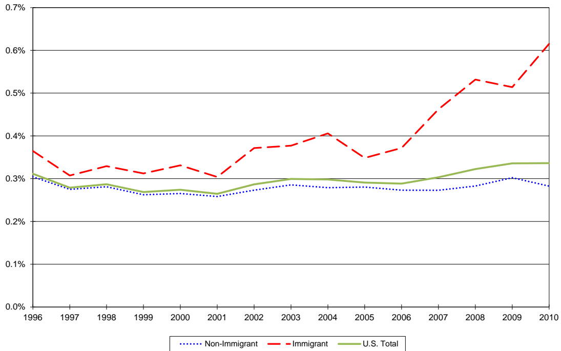
Figure 1 Entrepreneurship Rates by Immigrant Status (1996-2010)